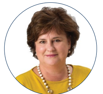
Joan Simeon Chief Executive Medical Council of New Zealand